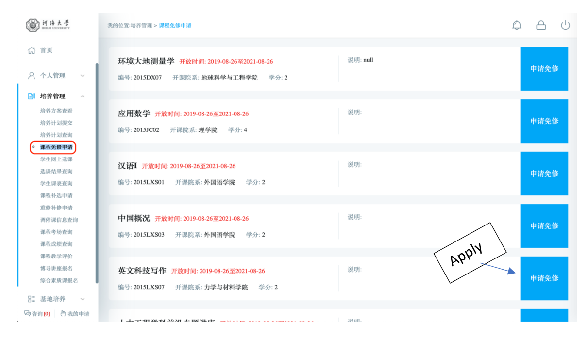
Fig. 3: Course exemption application