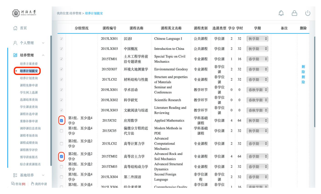
Fig. 2: Course submission