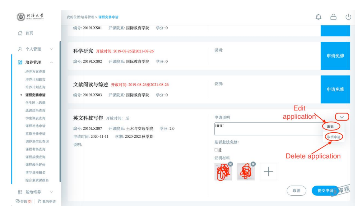
Fig. 5: Course exemption application status

You can check (edit or delete) your application status here after submission.